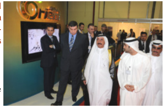
The Media and Marketing Show.

The upturn in exhibitors for the show is reflective of the renewed confidence within the media industry after the economic downturn in 2009.